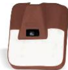
Fig. No. 182