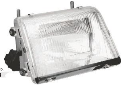
Fig. No. 148