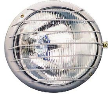
Fig. No. 198