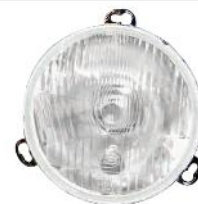
Fig. No. 188