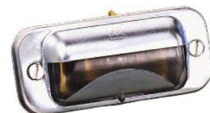
Fig. No. 157

Also Suitable for Mahindra & Mahindra* Alfa, Champion