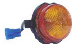
Fig. No. 143