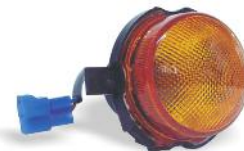
Fig. No. 129