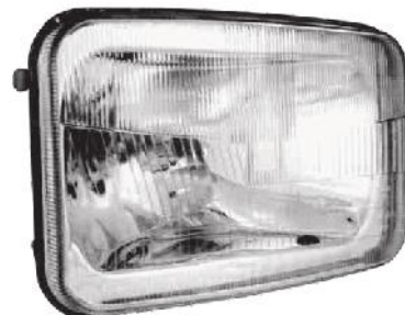
Fig. No. 201