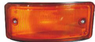
Fig. No. 147