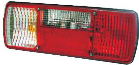
Fig. No. 145