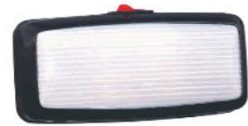
Fig. No. 140