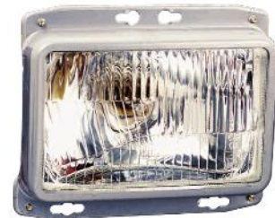
Fig. No. 154