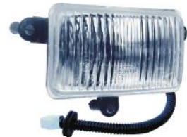
Fig. No. 139