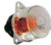
Fig. No. 159