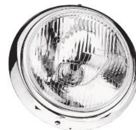
Fig. No. 185