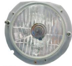
Fig. No. 158