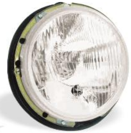
Fig. No. 190