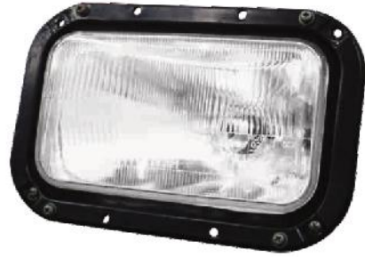
Fig. No. 133