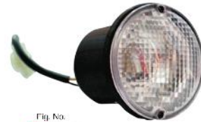
Fig. No. 160