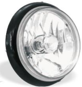
Fig. No. 191