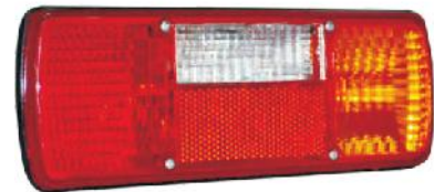
Fig. No. 172