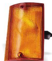
Fig. No. 193