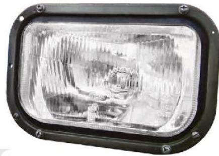
Fig. No. 135