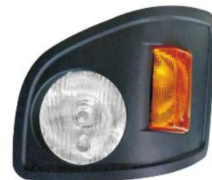
Fig. No. 187