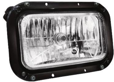
Fig. No. 136