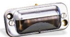
Fig. No. 192