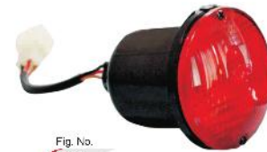
Fig. No. 161