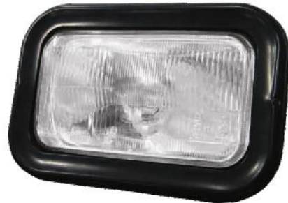
Fig. No. 134