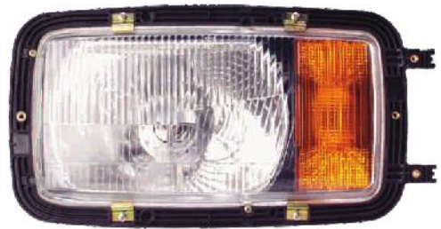
Fig. No. 199