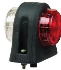
Fig. No. 151