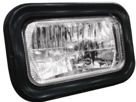
Fig. No. 137