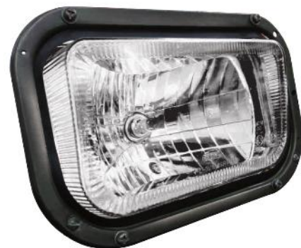
Fig. No. 138