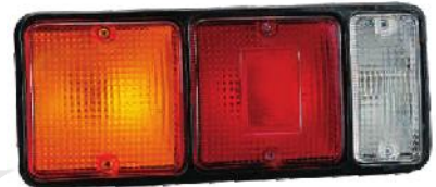
Fig. No. 171