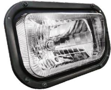
Fig. No. 169