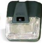
Fig. No. 175