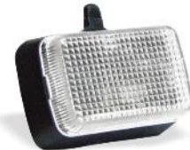
Fig. No. 124

Also Suitable for TATA Ace Refresh / Magic CL 314 LED 12V - AUTOPAL E-Rikshaw