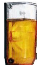
Fig. No. 155