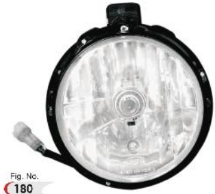
Fig. No. 180