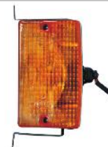
Fig. No. 189