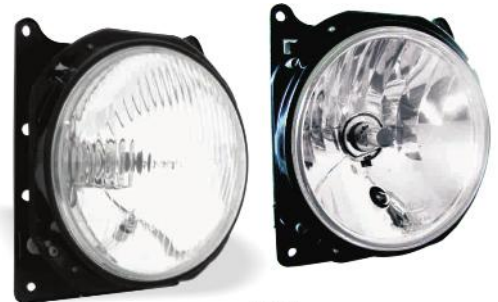
Fig. No. 127