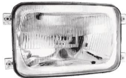
Fig. No. 200