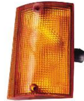
Fig. No. 150