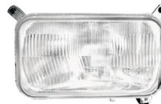
Fig. No. 186