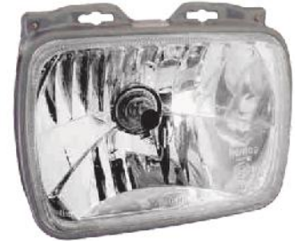
Fig. No. 170