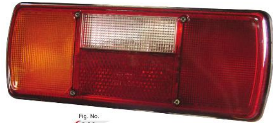
Fig. No. 144