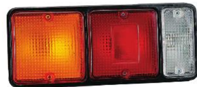
Fig. No. 156