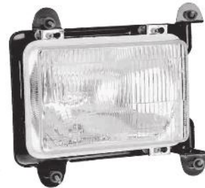
Fig. No. 149