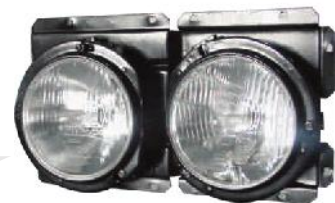
Fig. No. 142