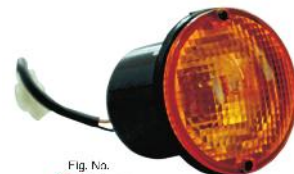
Fig. No. 162