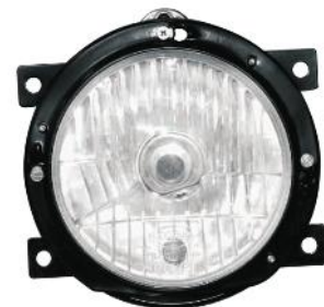
Fig. No. 152