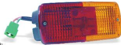
Fig. No. 130